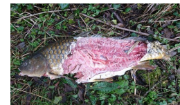
Pictures of otter kills of fish.